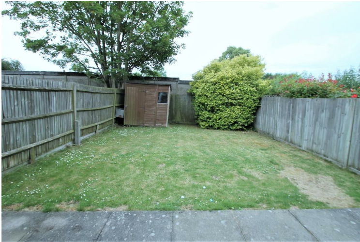
Rear Garden with shed and lawn area