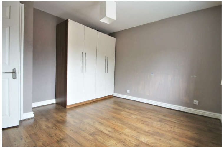
A bright double bedroom with a triple door wardrobe