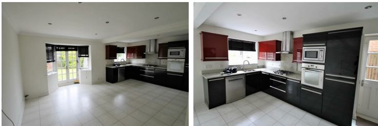
A bright and very spacious kitchen diner with plenty of light and double doors leading to the rear garden and a side door leading to the side alley