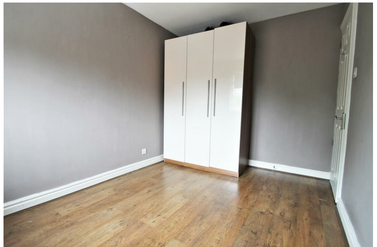
A bright double bedroom with wardrobes and double glazing windows.