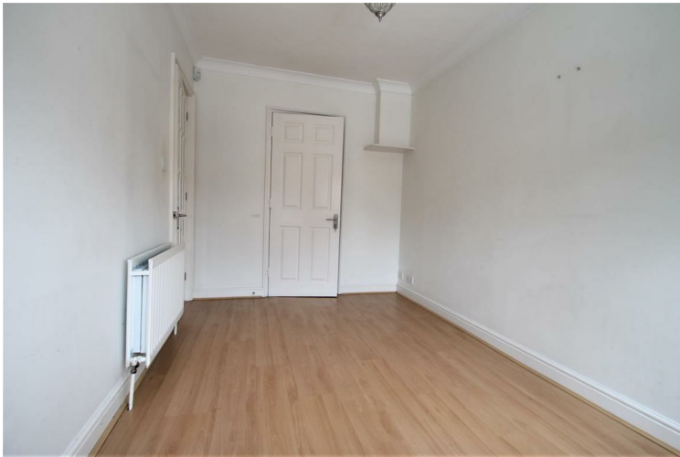
A bright reception room leading to Utility room