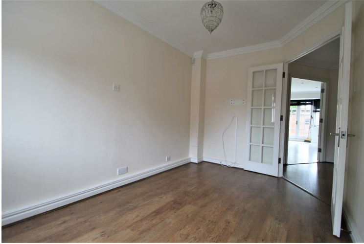
A bright reception room with double doors leading to the hallway