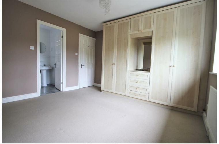
A bright a spacious bedroom with built in wardrobes and an en-suite bathroom